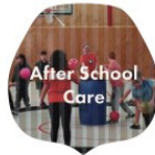
After School Care