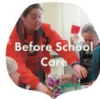
Before School Care