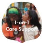
1-on-1 Care Support