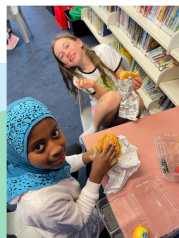
Gorllia Burger Lunch!