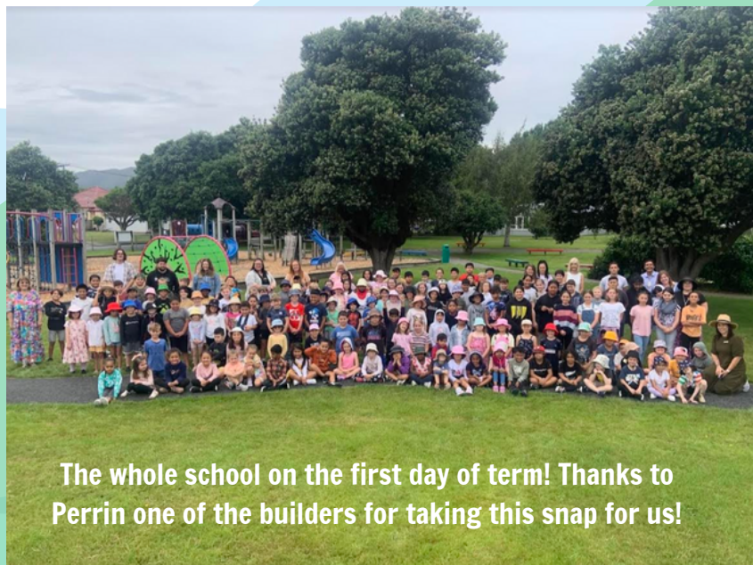
The whole school on the first day of term! Thanks to Perrin one of the builders for taking this snap for us!