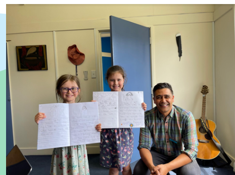
Some tamariki who arrived on a 'Mana' card to share their work