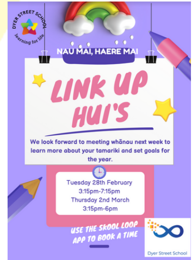
Link Up Hui next week