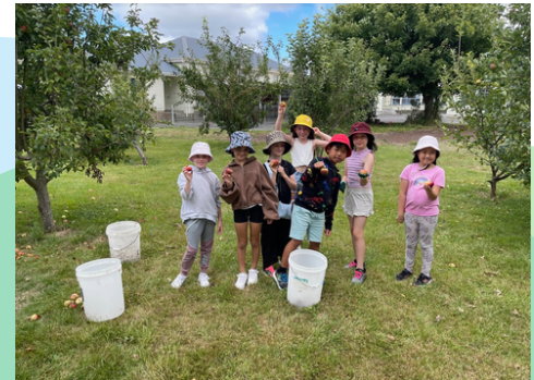
Tamariki collecting fruit from our school orchard