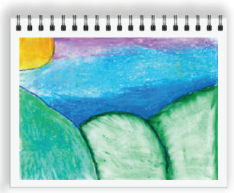
Note/sketch hard cover book