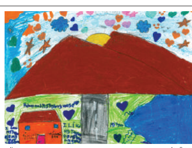
Age, Koom JANUARY 2024

child's artwork as it will appear when printed, please choose products carefully.